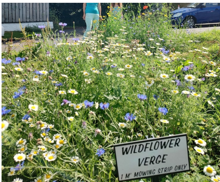
Example site that has been subject to resident involvement during 2022 trials.