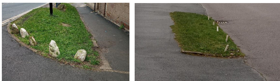
Examples of resident installed verge protection measures to prevent parking