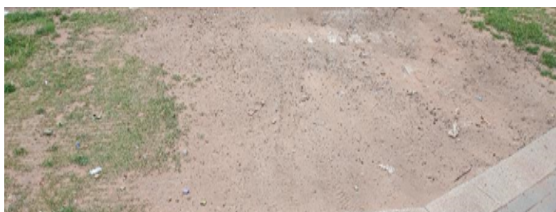
Example illegal driveway crossing