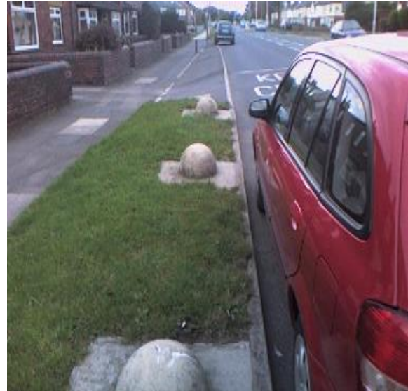
Example of Domed Concrete “Mushroom” bollards