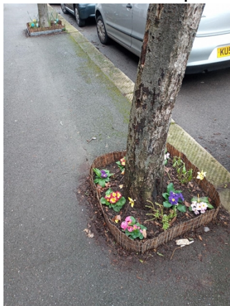
Example “Fairy Garden”

close to trees and potentially damaging their root systems will be tolerated.