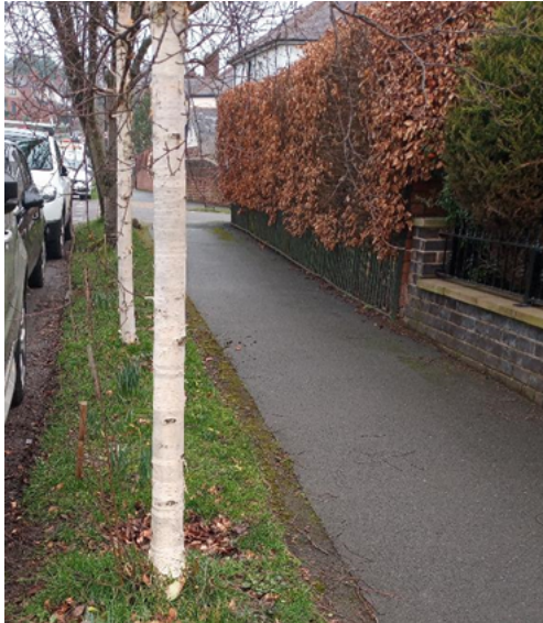
Example of preventative tree planting