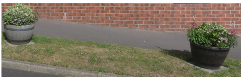
Example Barrel Planters placed by residents to prevent verge parking